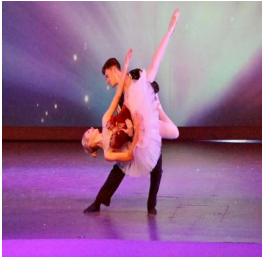
Sugarplum Fairy and Cavalier "Nutcracker" 2019

Coming Spring of 2020 "Cinderella" and More May 16 — 2:30 & 7:30 HSU - Behrens Auditorium