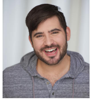
Richard Gomez (Val)