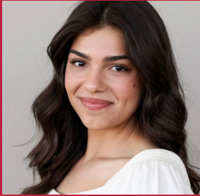
"THE RUNAWAY" NOUWEN CRAFT